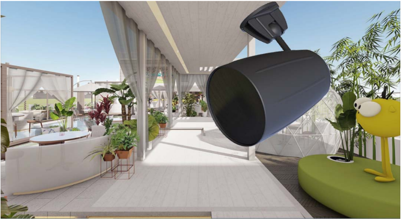
In or atop ground installtion (PS-4404/PS-4504/PS-4604)